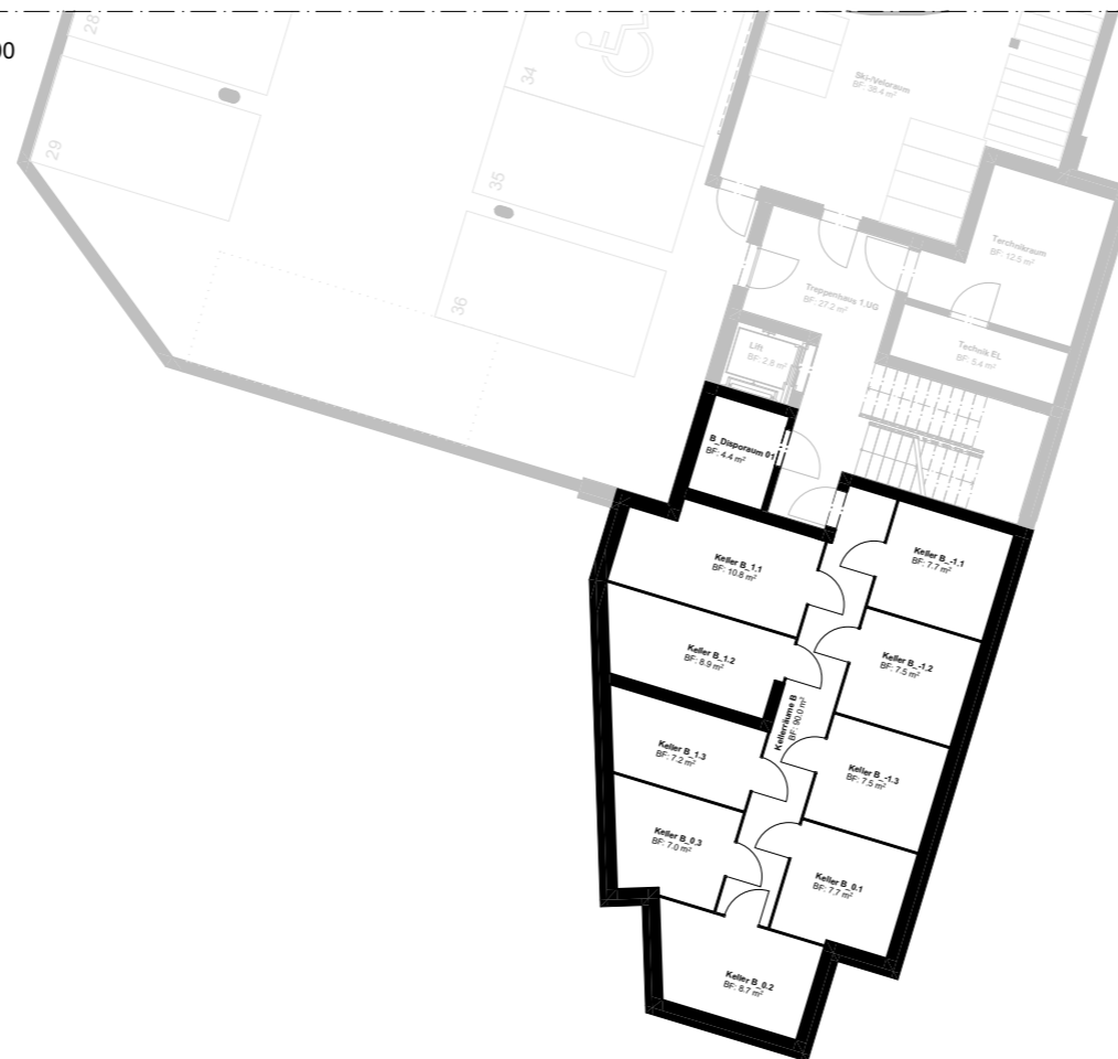
Keller Haus B Grundriss 2. UG, M. 1:100